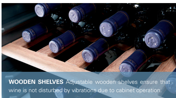
WOODEN SHELVES Adjustable wooden shelves ensure that wine is not disturbed by vibrations due to cabinet operation.