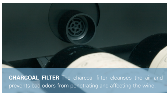
CHARCOAL FILTER The charcoal filter cleanses the air and prevents bad odors from penetrating and affecting the wine.