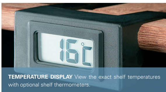
TEMPERATURE DISPLAY View the exact shelf temperatures with optional shelf thermometers.